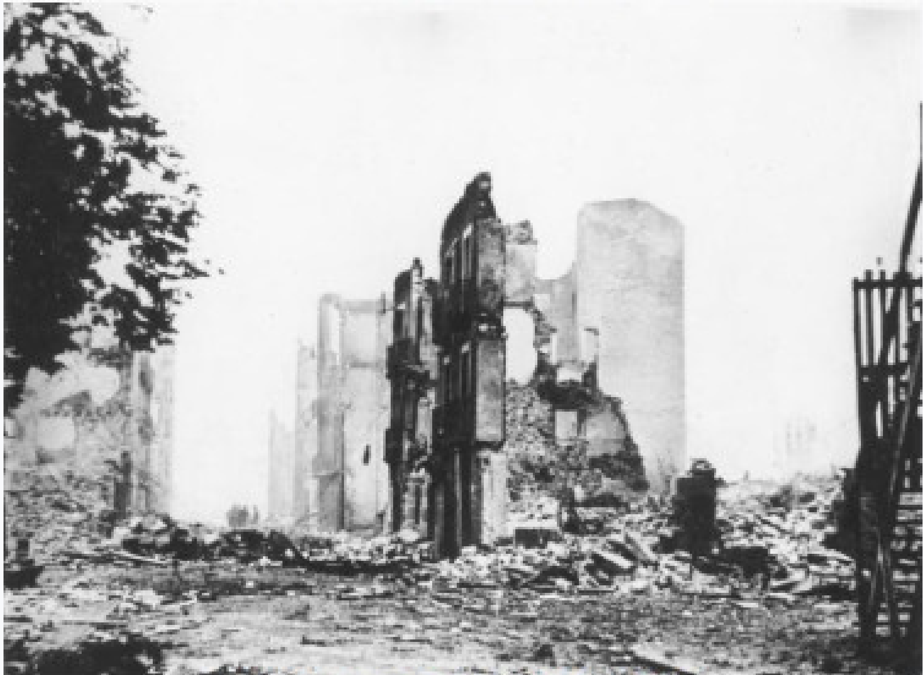
Ruins of Guernica (1937)